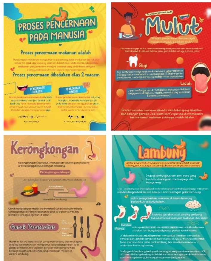
Figure 3. Media Teaching Materials Infographic Digestive System Material

The discussion on the digestive system material includes several things such as the structure and function of the digestive tract and digestive glands as well as the types of abnormalities (symptoms and causes) that occur in the digestive system. To deliver materials