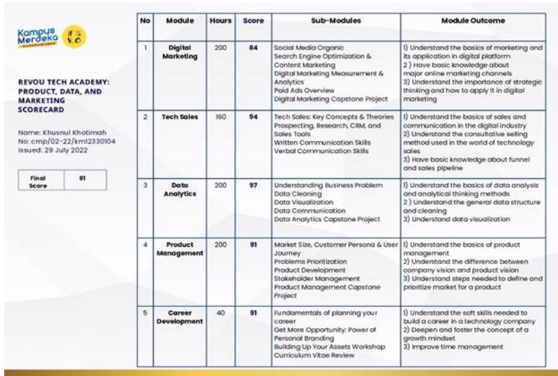
Figure 1. Transcript of BKP MSIB participant scores

Research findings on the suitability of the MSIB program with the scientific field of S1 students of Social Studies Education indicate a problem. Based on research data, it was found that there are still BKP MSIB that has not been linear with the scientific field of S1 students of Social Studies Education. This fact is evidenced by the results of a comparison between the presentation of the material obtained by students in place of applying for BKP MSIB, with the presentation of conversion courses presented by related study programs.