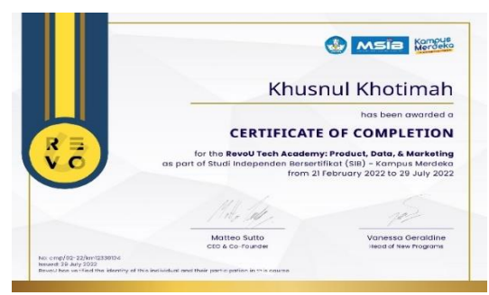
Figure 1. BKP MSIB participant certificate

Based on the exposure of the results of the study found that the implementation of BKP MSIB in S1 students of Social Studies has been able to meet the implementation goals. Students participating in BKP MSIB do not only get work experience. Based on the purpose of MBKM certified internship, students also have the opportunity to obtain relevant knowledge from the institution where the internship takes place. The relevant knowledge in question is Hardskill and Softskill, as the achievement of competence recognized by the institution where the informant internships with the provision of certificates at the end of the internship implementation time. This is in line with Presidential Regulation No. 8 of 2012 concerning the National Qualification Framework Article 4 paragraph 1 which reads "Learning Achievement obtained through education or job training is stated in the form of a certificate". Based on research data, researchers found that all S1 students of social studies education certified interns have received a certificate in recognition of the achievement of internship learning. Researchers argue that the duration of the implementation of BKP MSIB is ideal. Setiawan & Thenarianto (2021) explained in their research that the recommended ideal internship duration is 3-6 months of implementation. The results showed that the duration of the internship / course is 5 months of implementation.